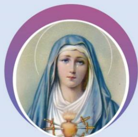
Mother of Sorrows MSFS PATRONESS