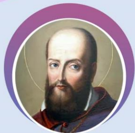
St. Francis De Sales MSFS PATRON